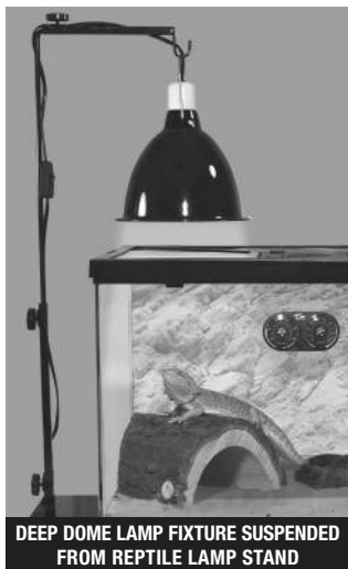
DEEP DOME LAMP FIXTURE SUSPENDED FROM REPTILE LAMP STAND